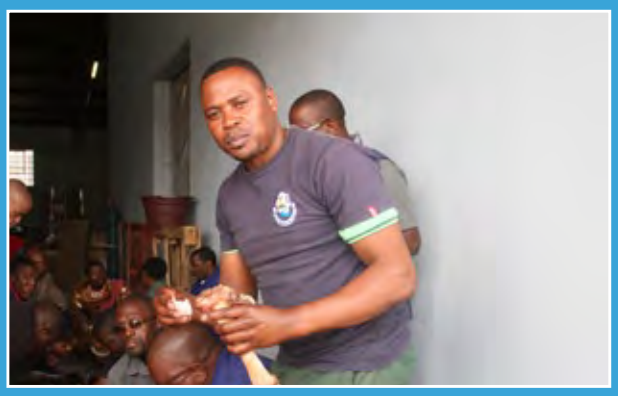
Mfanimpela feasting on the food that was prepared for all employees