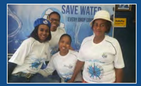
Manzini Revenue staff members looking all bright and blue