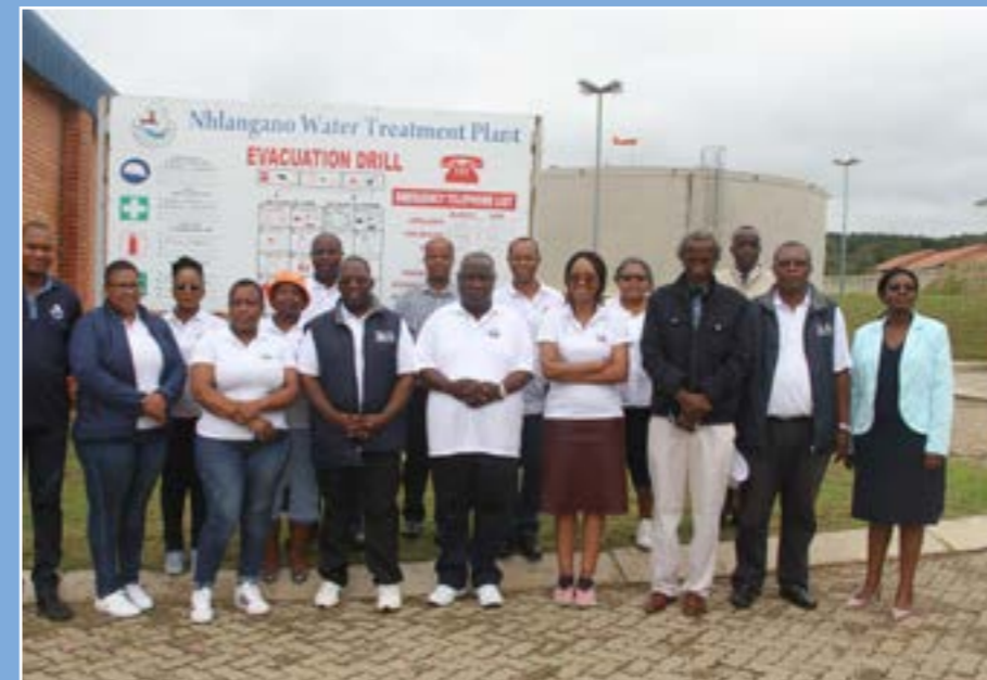
EWSC Board Members ,EWSC South West Team and the Managing Director at the Nhlanguano Water Treatment Plant