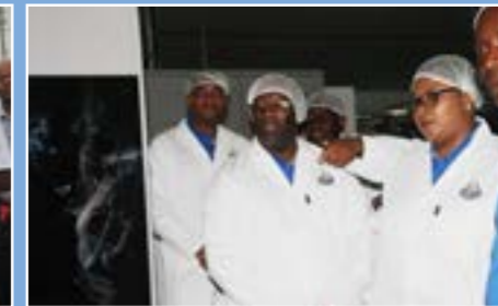
The Board Members touring the Ecowater bottling Plant in Nkamanzi