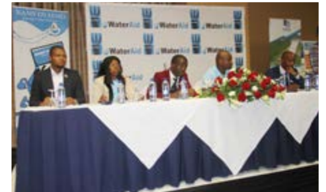
Presenters from different entities waiting to present on the theme