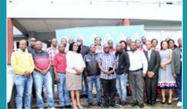
Staff Association, Union Reps and EWSC Management after signing