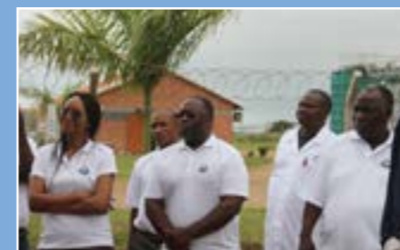
The Board Members and MD admiring a water kiosk