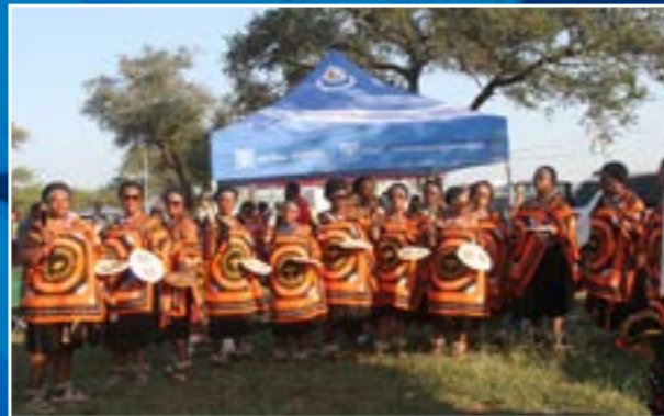
EWSC Lutsango rehearsing before marching into the arena