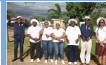
EWSC Managing Director and Board Members at Simunye Water Treatment Plant