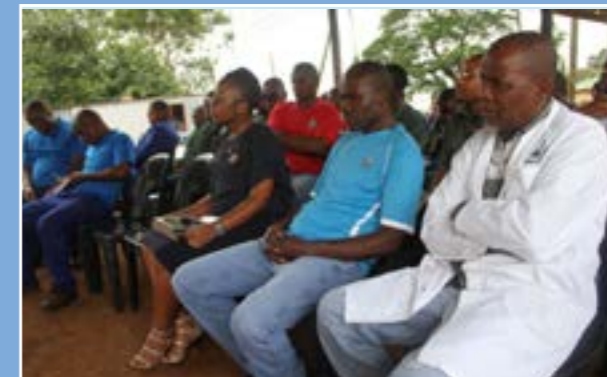
East Region employees following proceedings during the meeting