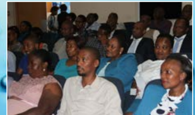
EWSC employees and other stakeholders following proceedings