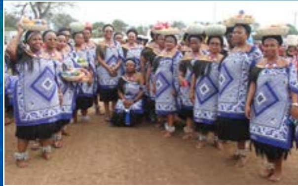
EWSC Lutsango waiting for their turn to present gifts to Their Majesties