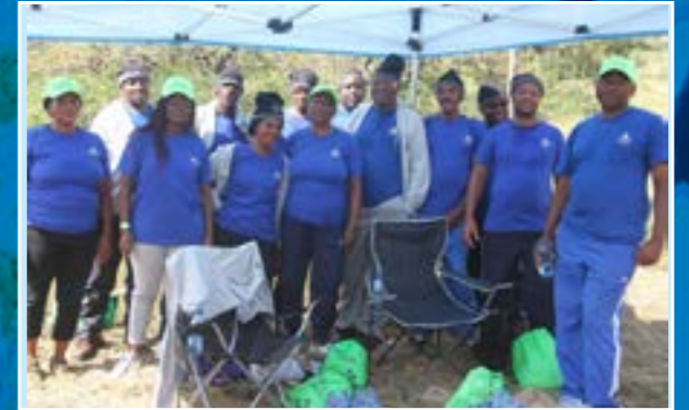
South West Regional Manager and her team at the Mahamba Gorge Hiking