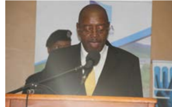
Hon. Minister for Natural Resources Senator Peter Bhembe making his remarks on the theme “Leaving No One Behind”