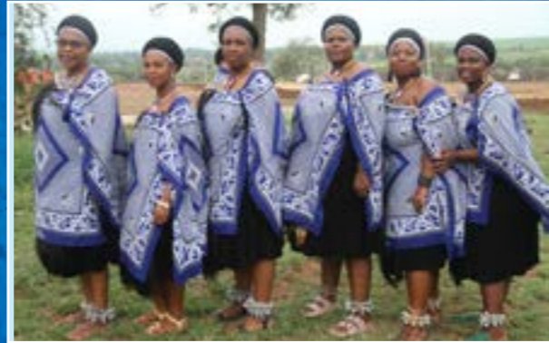
EWSC Lutsango elegantly dressed in their traditional attire at the Hlane Royal Residence