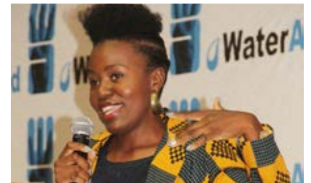
Chishala discussing the theme and how it relates to the youth