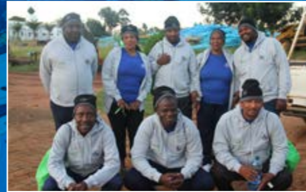
Moments captured at the Mahamba Gorge Hiking event