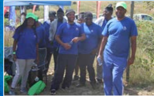
EWSC South West Team representing the entity at the Mahamba Gorge Hike