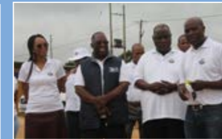
The team touring the Nhlanguano Wastewater Treatment plant